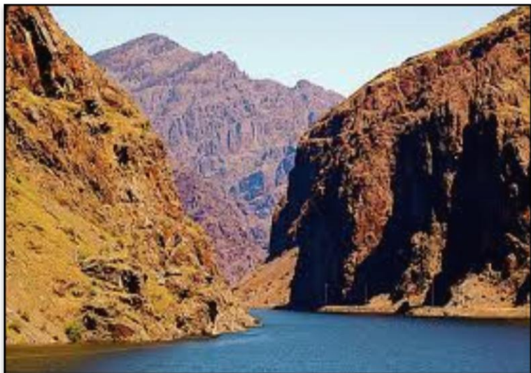
Hells Canyon and the Snake River

The dramatic Wallowa Mountains of northeast Oregon are awe-inspiring and serve as a perfect backdrop for the artsy village of Joseph and the sparkling blue water of Wallowa Lake. This five day tour begins with a breathtaking gondola ride to the summit of Mt Howard and a visit to the Valley Bronze Showroom. Then travel to Washington for a jet-boat ride into North America's deepest and most rugged gorge, Hells Canyon. See 2,000-year-old petroglyphs and perhaps elk, bighorn sheep, and mountain goats. Tour a historic flourmill filled with artifacts and antiques and dine in the elegant Marcus Whitman Hotel built in 1927. The Tamastlikt Cultural Institute of Native American history and the popular Pendleton Underground are both well worth a visit. This trip is a geological feast for the eyes and an exciting step into history. Note that some walking is necessary.