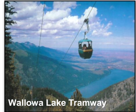
Wallowa Lake Tramway