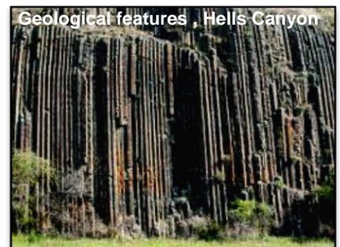
Geological features, Hells Canyon

Breakfast, lunch and dinner included No added cost