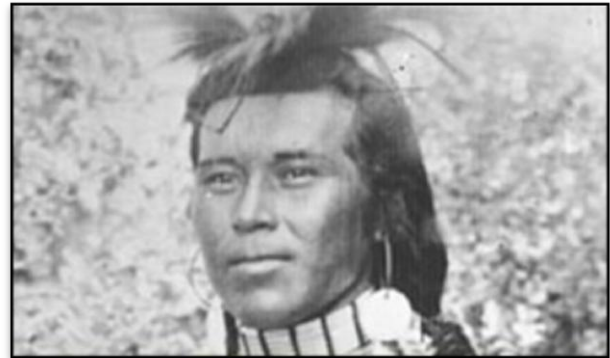
Tamastlikt Cultural Institute photographs