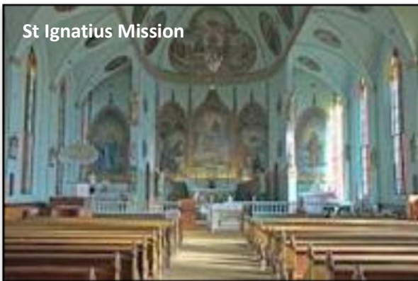
St Ignatius Mission

Today we leave the national park and travel along the shoreline of Flathead Lake. Almost thirty miles long and fifteen miles across at its widest point, Flathead Lake is the largest natural lake in western U.S. Stop in St. Ignatius at the unique 120-year old mission where the most exceptional feature of the interior are the 58 murals painted by Brother Joseph Carignano, an untrained artist who worked as a cook in the mission. Spend time in the gift shop, see museum displays and visit the log home which was the original Sisters' residence. Stop for lunch in St Regis then continue on I-90 over Lookout Pass where we cross into the Pacific Time Zone. Be sure to move your watches earlier one hour.