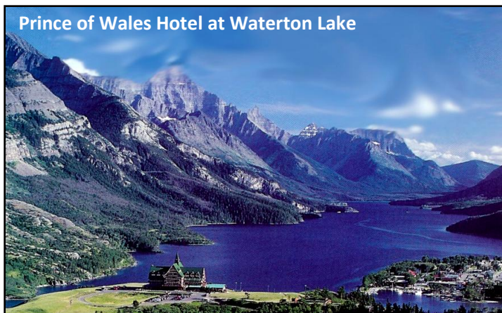
Prince of Wales Hotel at Waterton Lake

This morning stop at the Frank Slide Interpretive Centre at Crowsnest Pass where in 1903 there occurred a massive landslide. Continue through Alberta enroute to Waterton Lakes National Park, where we are greeted by incredible beauty, history and wildlife. Keep an eye out for bison that frequent the area just inside the park. Arrive at the renown Prince of Wales Hotel, another in a long line of Canadian historic and magnificent structures built in the 1920's by the Great Northern Railway. Set on a bluff, it provides some of the most exquisite views of Waterton Lake. A local professional guide joins us this afternoon for a narrated sightseeing tour of the area.