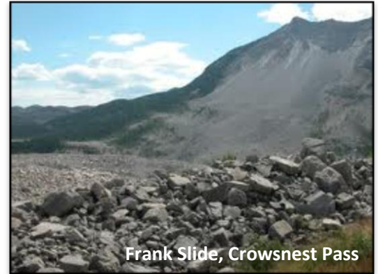
Frank Slide, Crowsnest Pass

Breakfast, lunch and dinner included. No added cost