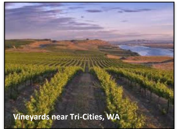
Vineyards near Tri-Cities, WA

The total cost for this trip is only: $1999 per person double occupancy, $2599 single occupancy, $1858 per person triple occupancy. Tour includes: seven nights hotel including two nights at the renowned Prince of Wales Hotel in Waterton Lakes and one each at popular Glacier Park Lodges, baggage handling at each hotel for one suitcase per person, seven breakfasts, four lunches, four dinners, admission to Frank Slide Interpretive Centre, entrance fees to Waterton Lakes National Park and Glacier National Park, narrated tour with a professional local step-on-guide in Waterton Lakes, narrated cruises on Waterton Lakes and Lake McDonald, Red Bus Tour on Going-to-the-Sun Road, all Experience Oregon motorcoach transportation and sightseeing as per the itinerary, taxes and gratuities for the above, and services of an Experience Oregon Tour Director. Customary and optional gratuities for the driver and escort are not included in the price of the trip.